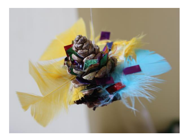
Figure 20: Enchanted pine cone.