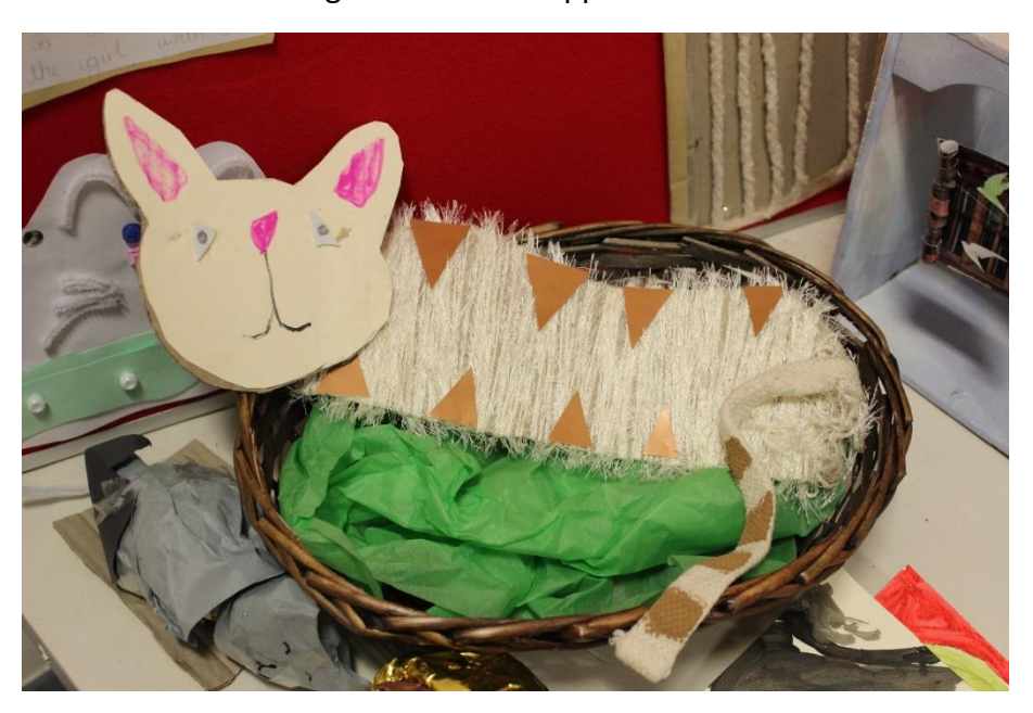
Figure 6: The cat from the painting Childhood, 1926, as discussed in schools presentations. The painting also featured in educational panels in the exhibition.

Attendees of workshops contributed to collaborative artwork using imaginative ideas about art, the everyday and community. These engagements and the resulting art exhibition in the Central Library, Coventry, July 2017, formed an important output. Please see images below as well as further images included in Appendix 5.