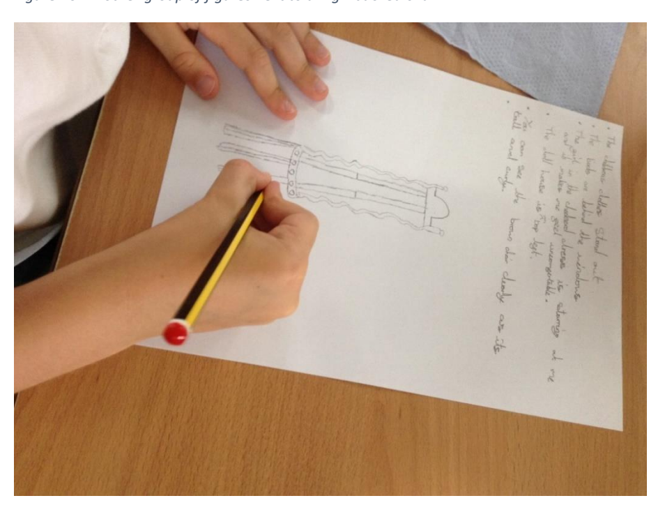
Figure 11: Sketching images from the paintings during an outreach session with St. Christopher's School, 19 June 2017. Shown, is a spiritual high-backed chair in the style of Charles Rennie Mackintosh as discussed in my presentation at the start of this session.