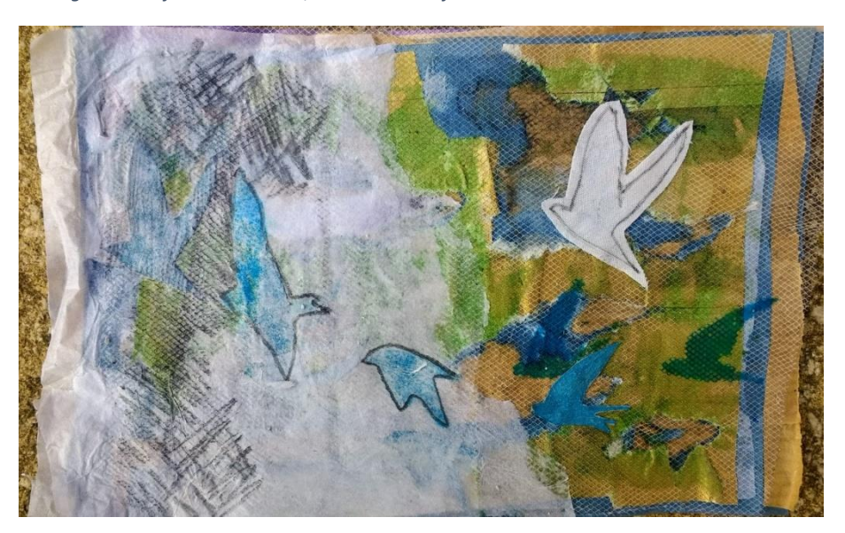
Figure 25: Untitled Artwork by Holly Dawes who delivered presentations at events.