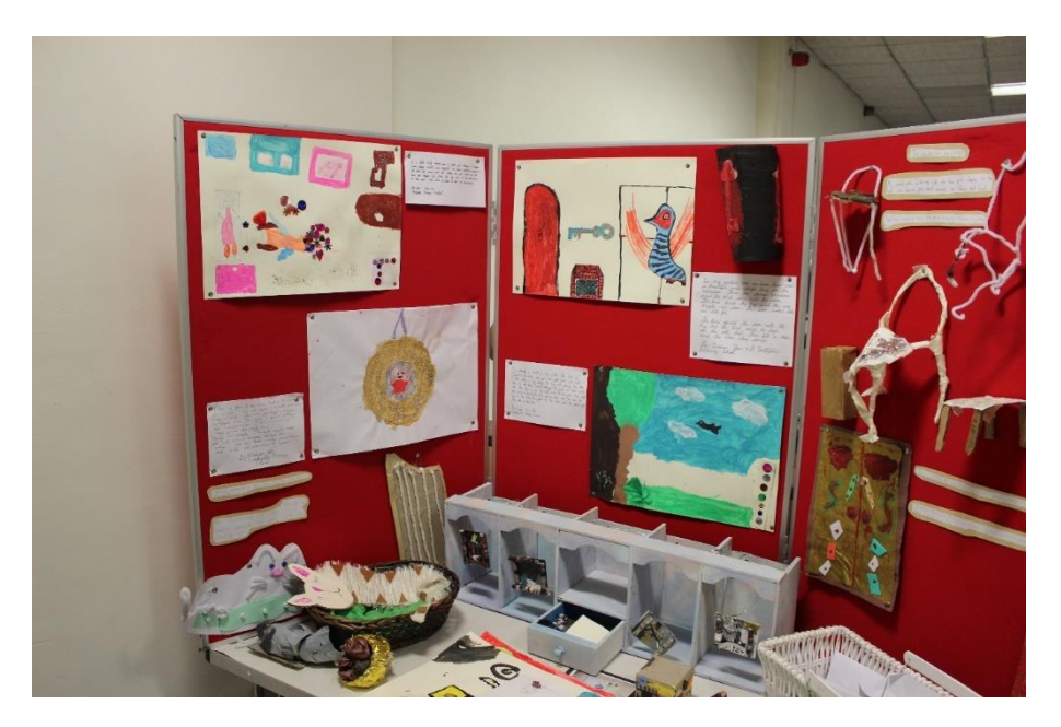
Figure 18: More of the exhibition featuring the children's artworks, which included 'spiritual' chairs from the paintings and the 'knowing' cat which the child holds in Frederick Cayley Robinson's Childhood, 1926. Other symbols include birds, keys, doorways, closed wardrobes. Images were used in paintings to denote secret knowledge and spiritual forms in the everyday. 15th July, the Central Library, Coventry.