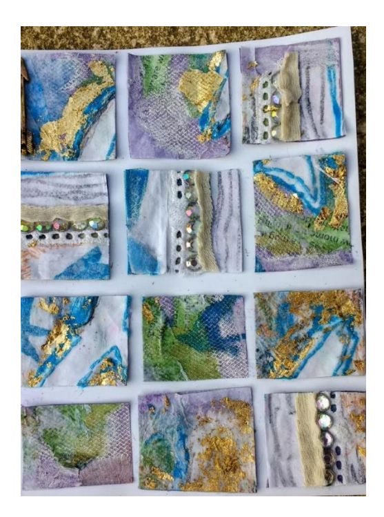
Figure 26: Untitled Artwork by Holly Dawes, who delivered presentations at events who codelivered sessions.