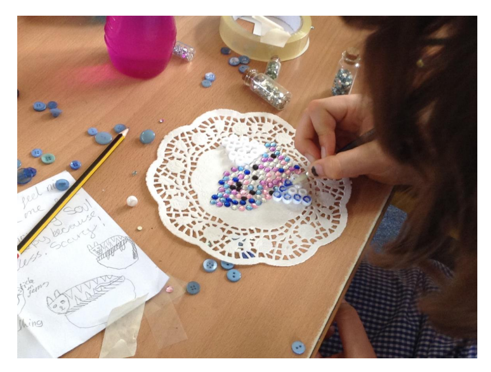
Figure 14: St. Christopher School outreach session 19 June 2017. Notes about the 'scary' cat in the paintings are next to this child who is making a bluebird design.