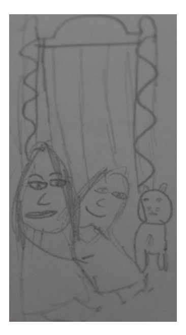
Figure 10: Another group of figures next to a high-backed chair.