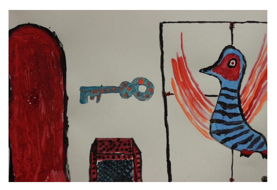
Figure 1: Artwork created during outreach sessions. Children used many features from Frederick Cayley Robinson's artworks: here a blue bird, mysterious cabinets, doors and keys.