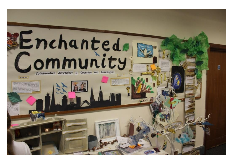
Figure 3: One of the exhibition displays. Coventry Central Library.

In Cayley Robinson's dimly lit interiors, in the fading light of day, women stand silently around tables, thinking pensively and pouring milk for children. Firelight, traditional domestic activities and the quietness of these scenes suggest calm. Very soon, however, the viewer begins to notice the cramped nature of the rooms, the dungeon-like windows, the hooks on the walls, the towering cabinets with locked drawers. There are puzzling features such as circling birds outside the window, clustered objects in the corner, a tall Mackintosh chair and visual allusions to the artworks of Dante Gabriel Rossetti. Heightened stillness, the weighty looks on the faces of the figures, their isolation from one another and uncomfortable seating arrangements start to engender misgivings about the initial ordinariness of these scenes. The artist created many recurring images of women in psychologically charged interiors, painted from the 1890s until his death in 1927. In these paintings Cayley Robinson presented 'everyday subjects – groups of children by the fire,' providing a 'poetry of domesticity', which seemed to expound Coventry Patmore's ideal of the 'angel in the house,' as described in the artist's Obituary in The Times, 1927.<sup>iii</sup> However, while the pictures superficially seemed to accord with the comforting features of the domestic genre, a familiar staple in Victorian painting, they served to challenge these forms.