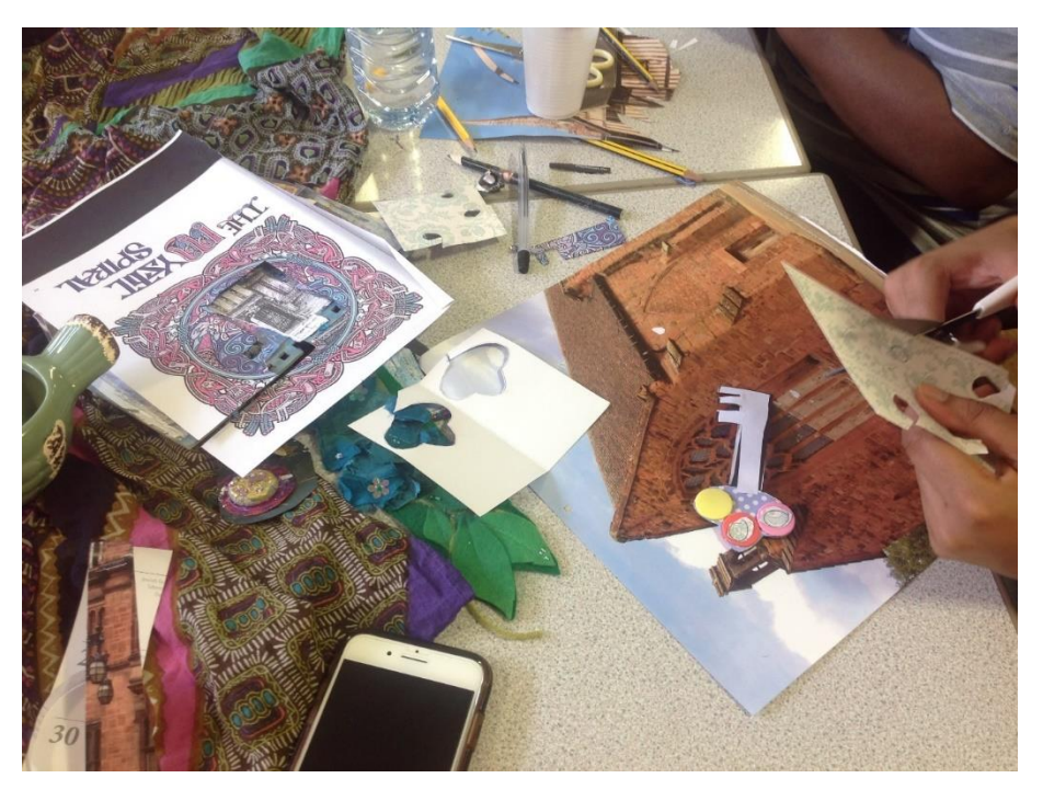
Figure 23: Artworks being made by women, 23 June 2017.