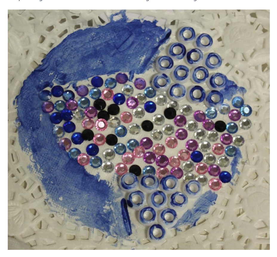
Figure 15: The final design as shown in the exhibition, July 2017, Coventry Central Library.

The children's notes in the classroom suggested they were enthralled most by the incomplete and enigmatic aspects of the pictures. Children's choices of subject for sketches and artworks reflect how they engaged with the themes of the Cayley Robinson paintings. We could also witness