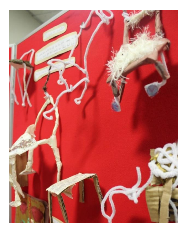
Figure 12: Chairs displayed at the exhibition, above.

Many blue birds also featured in the artworks made by children. During outreach sessions I discussed the connections to Maurice Maeterlinck's Symbolist play The Blue Bird published in London, 1911. This published edition had included unsettling illustrations by Frederick Cayley Robinson featuring circling birds. (Figs 1, 2, 13-15).