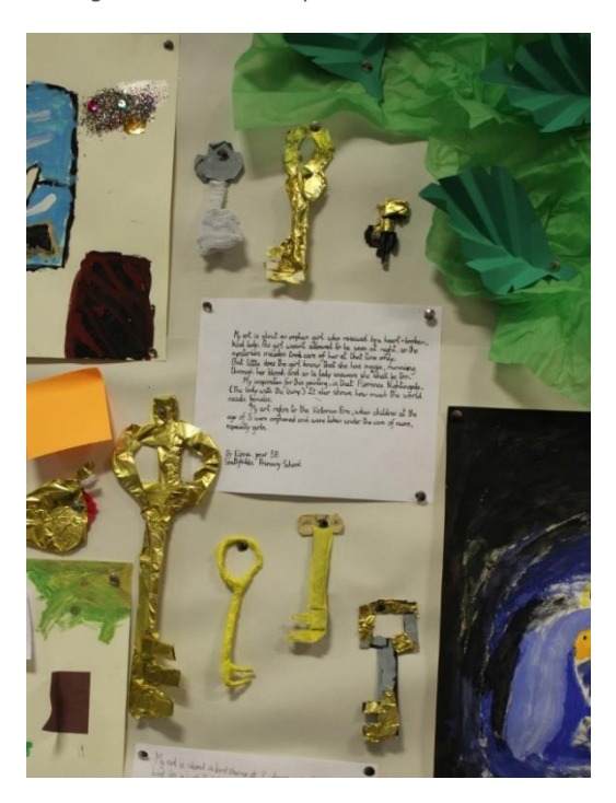
Figure 21: Keys on display in the Central Library.