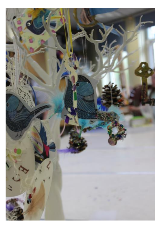
Figure 19: Images from the art events included many blue birds.