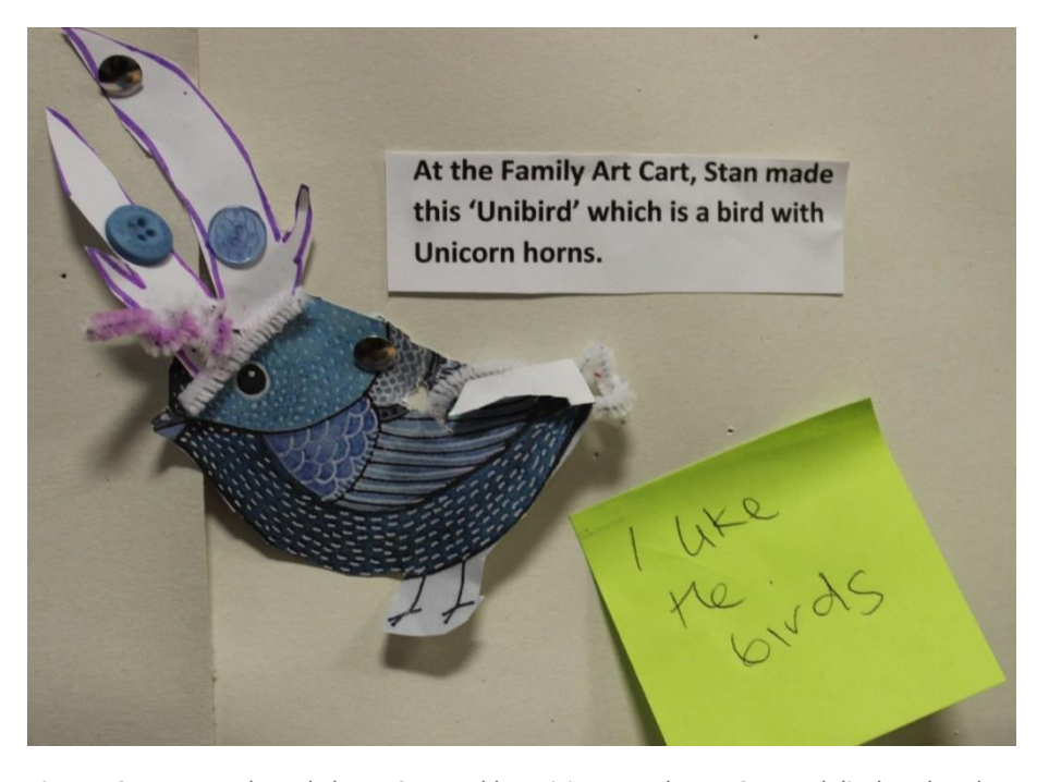
Figure 13: An artwork made by a 10 year old participant at the Art Cart and displayed at the exhibition, where another viewer has added a post-it comment, July 2017, Central Library.

Many blue birds also featured in the artworks made by children. During outreach sessions I discussed the connections to Maurice Maeterlinck's Symbolist play The Blue Bird published in London, 1911. This published edition had included unsettling illustrations by Frederick Cayley Robinson featuring circling birds. (Figs 1, 2, 13-15).