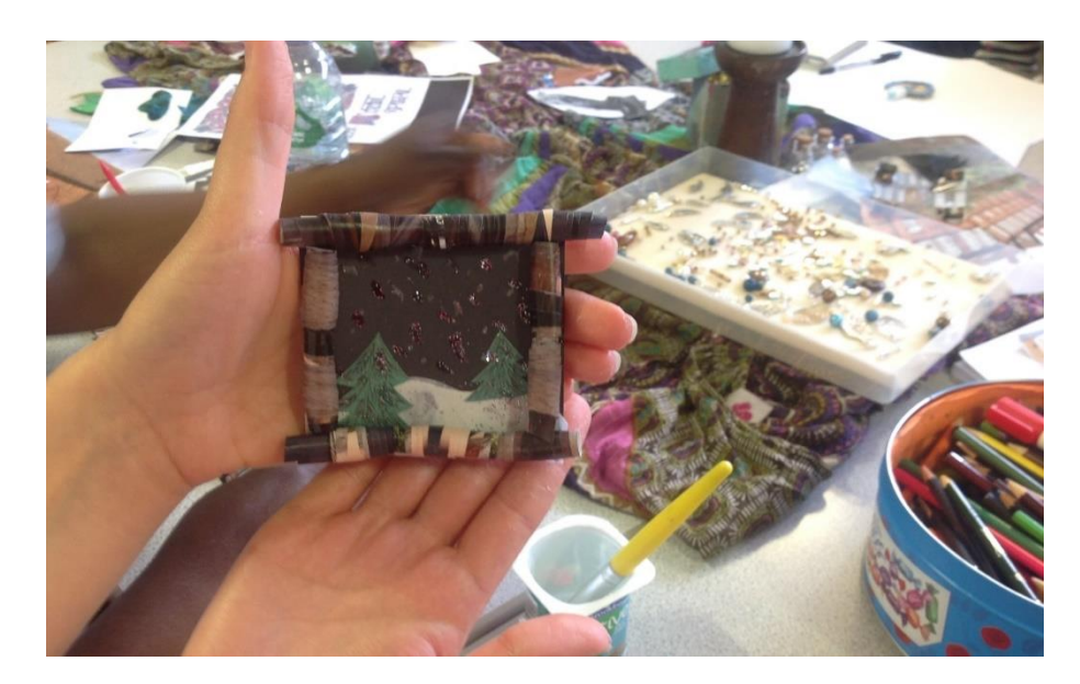
Figure 24: A finished artwork, FWT: A Centre for Women.