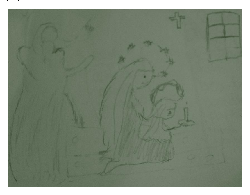
Figure 9: "Devotional Group" of figures sketched during outreach session

talismanic motifs, such as abstracted forms of roses, which along with circles and organic forms recurred as a secret symbolic language across a range of artworks by the Glasgow Four. Hermann Muthesius noted the use of 'gem-like effects' of small decorative areas in mostly white interiors. Icons and talismans were of interest to Symbolists who sought in art transcendence of the physical world and who deployed religious iconography to evoke religious ecstasy. Cayley Robinson included these Mackintosh chairs as hints of the occult but managed their unsettling import with tempering elements of childhood, traditional femininity and fairy tale like features. Mackintosh consciously aimed to create art with spiritual effects, connecting him with key artworks by Edward Burne-Jones, John Everett Millais and Dante Gabriel Rossetti all of whom inspired Cayley Robinson.