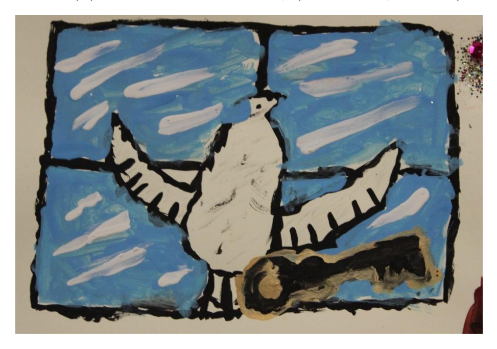
Figure 2: Children's artwork from the Enchanted Community exhibition, Coventry Central Library, July 2017, inspired by blue birds in Frederick Cayley Robinson's artworks.