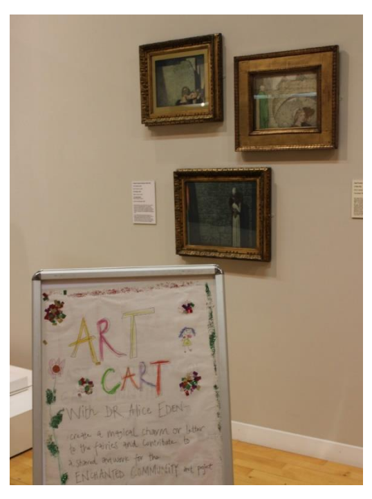
Figure 8: Sign advertising the Art Cart event next to paintings by Frederick Cayley Robinson.

During outreach sessions children created artworks on a number of subjects including windows, cabinets, chairs, female figures, lights, all with an air of mystery and danger. Sketches of devotional groups of figures, (Figs 9, 10 and Appendix 5), show that the children understood the elements of awe and religiosity in the pictures. One child wrote that the pictures were 'Freeky (sic) half. Scary. Colourful and old-fashioned.' Notes