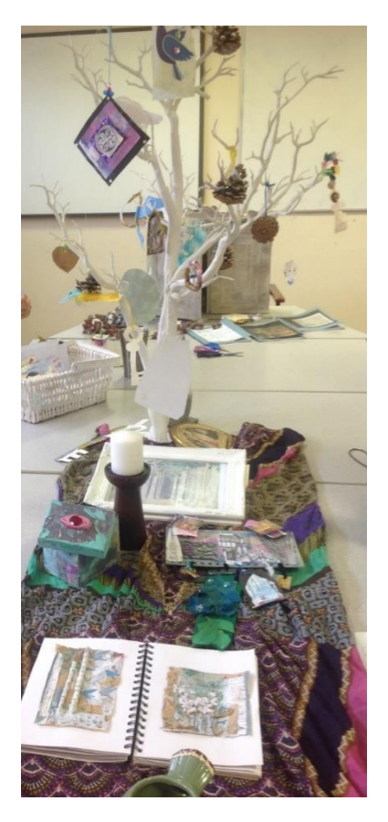
Figure 22: From the workshop at FWT: A Centre for Women, 23 June 2017.