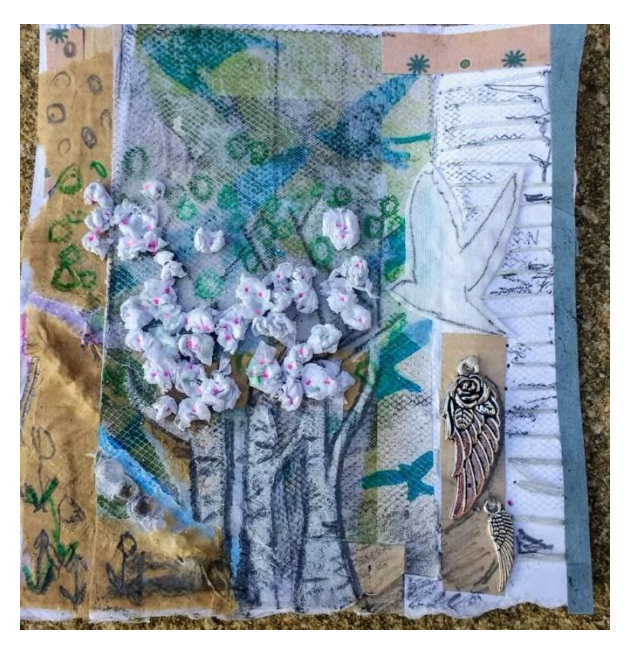
Figure 5: Artwork by Holly Dawes, a local artist who co-delivered sessions.