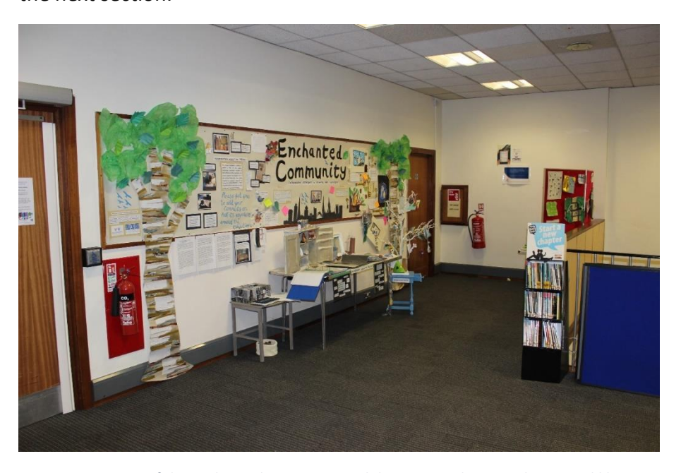
Figure 4: Part of the Enchanted Community exhibition, 15 July 2017, the Central library, Coventry.

The full list of project events are included as Appendix 1 and may be found on the project website: <a href="http://warwick.ac.uk/enchantedcommunity">http://warwick.ac.uk/enchantedcommunity</a>. Project partners are detailed in Appendix 2 . Throughout the project we welcomed participant feedback and provided a number of opportunities for this during both the workshops and the exhibition, which is explored in the next section.