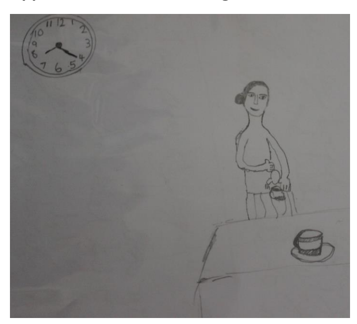
Figure 16: Sketch made during Enchanted Community, Schools outreach sessions.