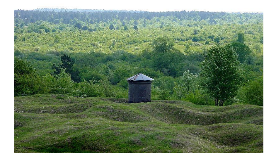
Figure 3: The 'Zone Rouge' of the Meuse. The preservation of the Great War soil profile is illustrated, along with the vast expanses of the 'Forêt de guerre'. (Photo: Landscape in Verdun Forest, F. Lamiot, 2004 via Wikimedia commons)

areas of forest, completely covering some battlefield sites (Payne 2008). 'The Zones Rouges' themselves exist today as a landscape of remembrance in their own right, and as a landscape still bearing the physical and material scars that act as reminders of the horrors that took place upon them over 90 years ago.