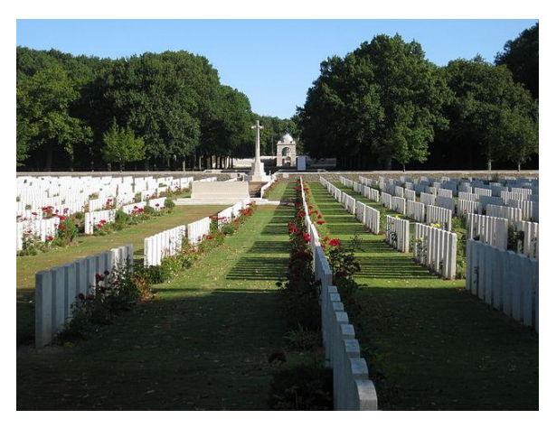
Figure 2: The remains of Delville Wood in 1916 and the cemetery in 2007, illustrating the human and natural suffering on the site. The multitude of trees was replaced with a vast field of crosses, at first temporary (see <a href="http://www.jocks.co.za/history.htm">http://www.jocks.co.za/history.htm</a>), then permanent.