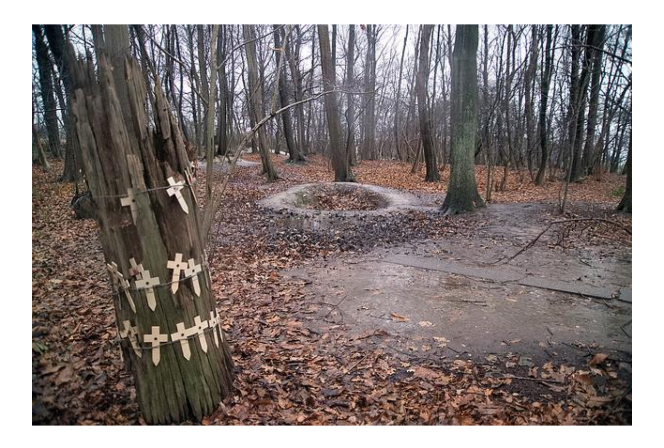
Figure 4: Sanctuary Wood, with craters amongst both the new trees and the shell-blasted stumps of the original wood, now used for a commemorative and memorial purpose.

Further examples of damage to trees and the landscape can be seen at <a href="http://bit.ly/1hyY9bw">http://bit.ly/1hyY9bw</a>, including a tree close to Sucrerie Military Cemetery that has been twisted and gnarled by the scars of shrapnel damage sustained during the hostilities.