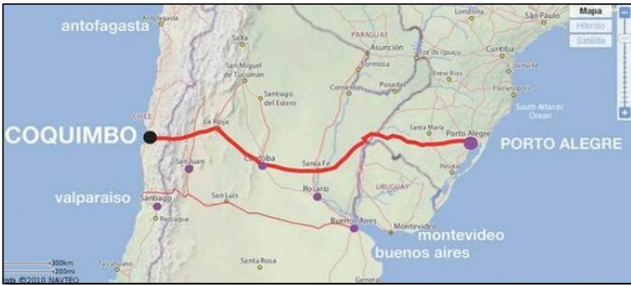
Image 3: Central Bi-Oceanic Corridor.

the irruption of China in South America, becoming one of the main trading partners of many of the countries in the region).