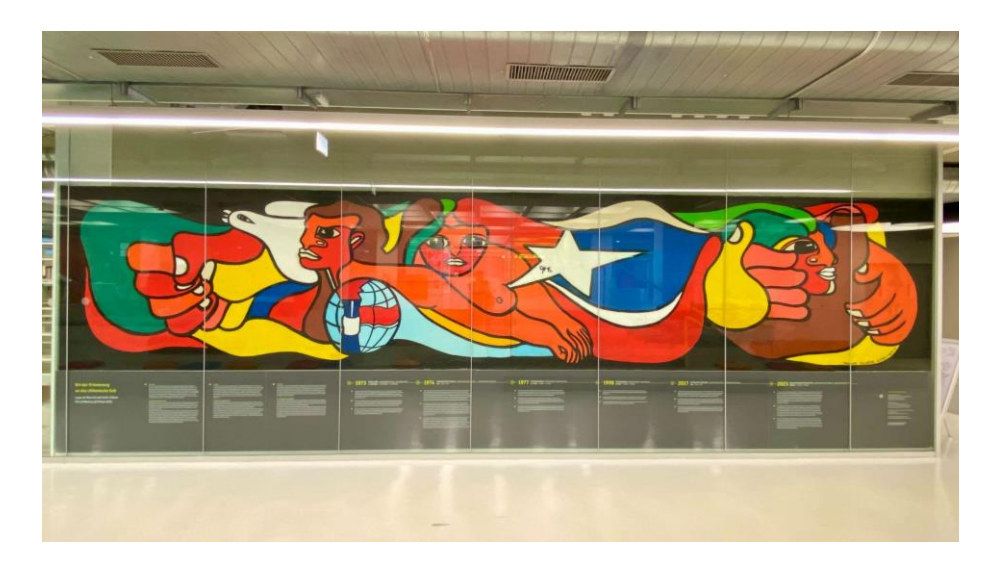
Figure 2: Brigada Pablo Neruda (1977). Untitled. University of Konstanz, Germany.

The mural at the University of Konstanz (figure 2) was painted by the Brigade Salvador Allende on 25 April 1977, during a concert by the exiled folklore ensemble Quilapayún and the local Chilean-German choir, Singegruppe , in the main Audimax auditorium (Quilapayún, 1977). During Quilapayún's performance, the brigade painted the mural on two canvases, which together measured 1.70m by 8.10m. At the end of the performance, the mural was hung on the wall opposite the Audimax, where it remained for more than four decades. It figuratively represents the global struggle for freedom of the Chilean people, personified by a female figure with a bare chest, her floating hair forming the Chilean flag, and symbols such as the clenched, oversized fist, a white dove and a globe.