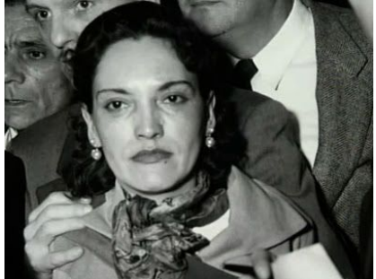
Fig.1 (left) Still from This Is Not America at 24 seconds showing the detention of Lolita Lebrón in 1954; Fig.2 (right) Photo of the real-life detention of Lolita Lebrón.