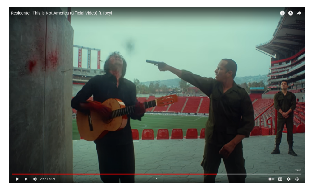
Fig.3 Still from This Is Not America at 02.57 showing the murder of Victor Jara in 1973

Survivors of the stadium-turned-detention centre recall how Jara's fingers were broken as he was forced to continue singing and playing his guitar. To this day, Jara's songs are sung at protests across the world16. The resurrection of his beaten and bloodied body together with his weapon - the guitar - does not merely add to the assemblage of historical events, but also reinforces Residente's message to Gambino. The scene directly references the shocking opening scene of Gambino's own video, in which the artist shoots an unarmed, hooded Black man in the back of the head as he is sitting and playing the guitar. By drawing this reference, Residente suggests that Gambino's victim is not exclusive to the territorial boundaries of the US. Bringing these two scenes into dialogue with one another prompts the spectator to question the relationship between the torture and murder of a beloved artist for his political position, and the heartless shooting of an unnamed Black man dismissed as collateral damage. Through the video's engagement with Latin American Cold War artefacts, Residente summons spectators and performers to make sense of wider struggles and