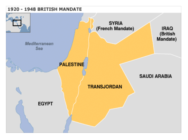
Map 2 British Mandate of Palestine and Transjordan

The issue of Palestinian refugees emerged after the establishment of the Zionist state on Palestinian land in 1948, which resulted in the forced migration of 750,000 Palestinians. The forced migration of Palestinians was called Al-Nakba, meaning 'The Disaster', where individuals were forced to leave their houses, land and property and find refuge in other countries, or in other areas in occupied Palestine ( Abu Murad, 2004 ; Khalidi, 2005 ; UNHCR, 2000 ). To respond to the Palestinian refugee issue, the United Nations Relief and Works Agency for Palestine Refugees in the Near East (UNRWA), was established in 1949 by the UN General Assembly, to become the sole relief and dedicated human development agency to provide Palestinian refugees with basic necessities such as