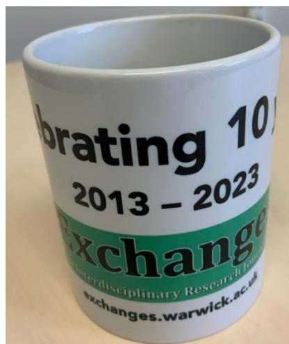
Figure 1: Do you have your commemorative mug?

Last issue in October 2023 we celebrated our tenth anniversary of publication. This marked somewhat of a major milestone for a journal founded by a small and enthusiastic group early career researchers (Johnson, 2023). An achievement worth commemorating we thought (Figure 1).