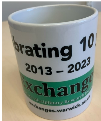
Figure 1: Do you have your commemorative mug?

Last issue in October 2023 we celebrated our tenth anniversary of publication. This marked somewhat of a major milestone for a journal founded by a small and enthusiastic group early career researchers (Johnson, 2023). An achievement worth commemorating we thought (Figure 1).