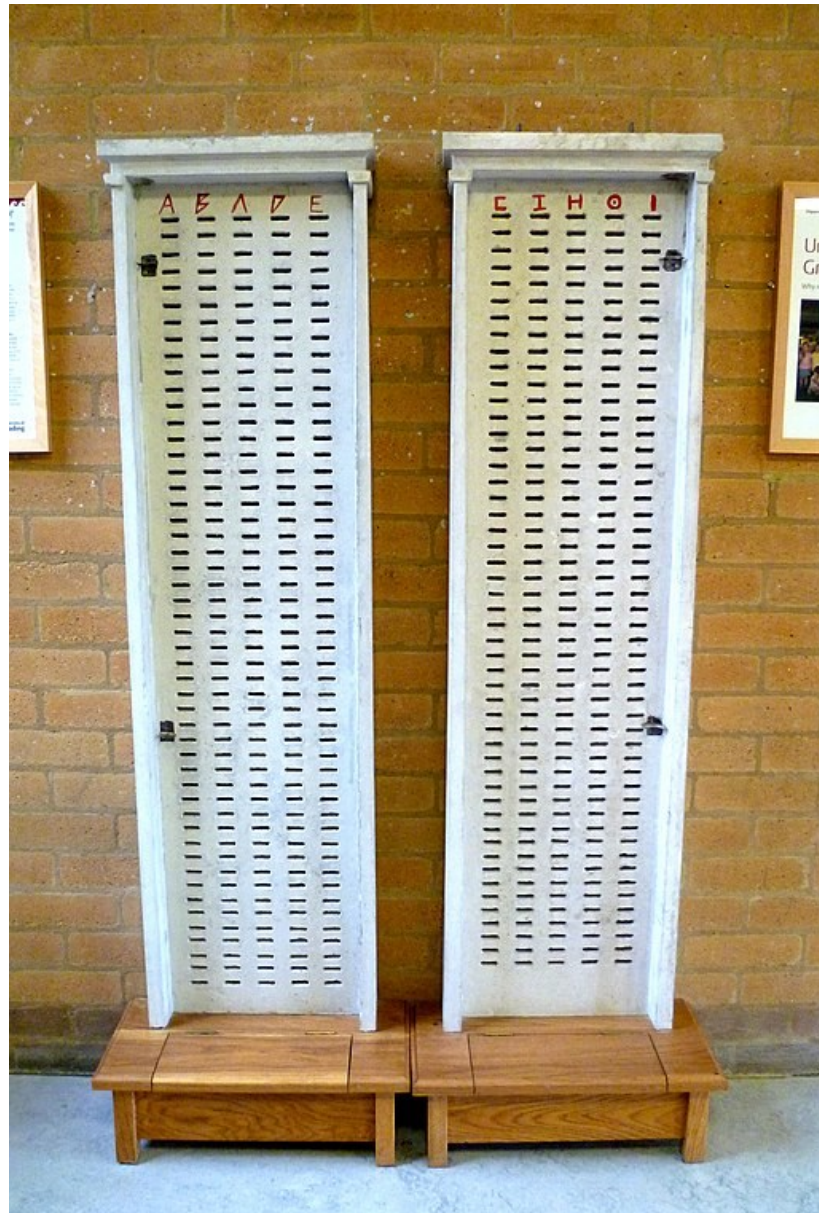
Figure 2. Reconstructed Kleroteria in the Ure Museum, University of Reading.

QD: They connect meaningfully, yes — to forms of voting, of community representation. There is a strong connection.