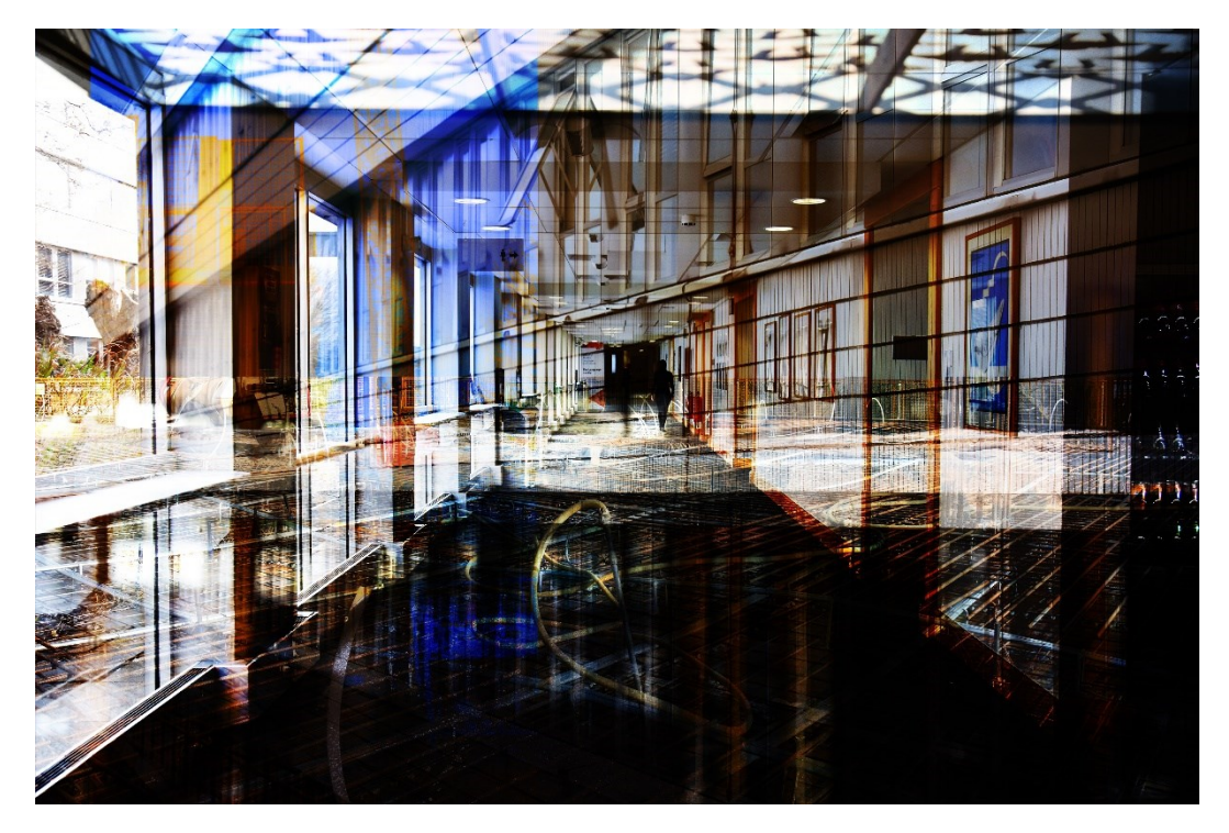
Figure 4: Afterimage IV, 6000 x 4000 px, digital collage.

The resulting work from visiting and documenting these sites at Warwick was in the form of the Afterimages series itself. The term 'Afterimages' attempts to describe the transient and faded memories that are tied to the site: a chair out of place, a scuff mark on the wall, an abandoned thumbtack no longer pinning anything. Whilst the images are often obscured, glimpses of bunting from an old Humanities corridor, construction workers, scaffolding, notice boards, and more are present in each print. The works, as shown in this article, are digital prints produced using numerous overlays of the images I took at both sites. Each image varies and displays different viewpoints of the two buildings, with characteristics from each intervening in the space of the other, often to the point of abstraction. The contrast between finished and unfinished, lived-in, and vacant space attempts to demonstrate how human it is to actively participate and engage with the buildings we inhabit. It also reflects upon how history unfolds in these spaces with both the building and the people changing and interacting with each other.