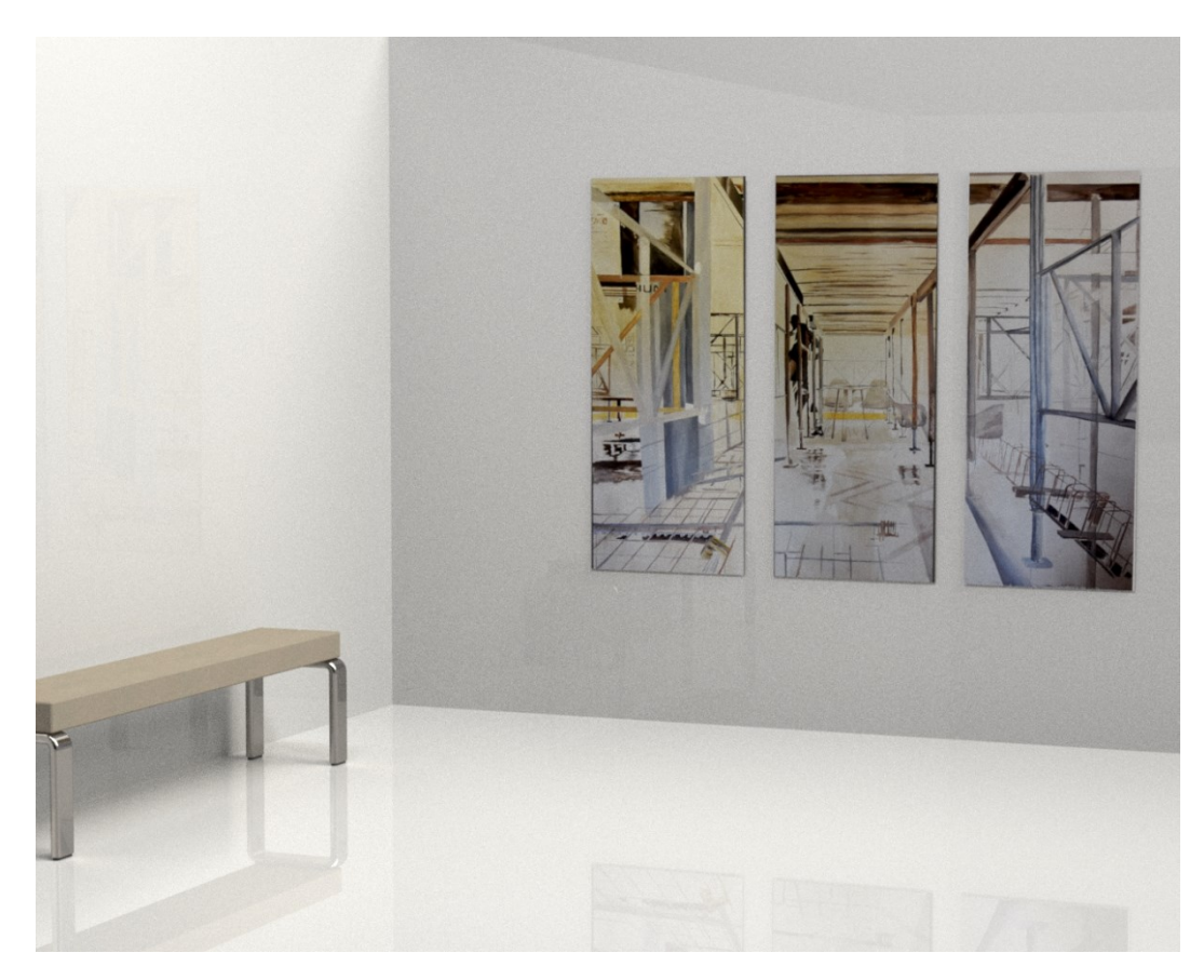
Figure 7: After Site scale view, 225 x 160cm, acrylic; ink; pencil on gesso primed plasticised poster paper, image render.

Exploring the campus of Warwick and reflecting upon its past, both within the Then & Now project itself and in creating the Afterimages series, has given me a greater appreciation of how the university is constantly growing physically and culturally. As Warwick's campus continues to evolve, students may arrive, and graduate never having experienced the physical site of their education without the presence of building sites and construction. The physical changes happening around campus at the moment are of particular concern to Arts students with the construction of the new Faculty of the Arts building. For students, the campus and its buildings as a place of both work and socialisation may form an integral part of the culture of a university in that we are inherently affected by our built environment, as suggested by the ideas of Krier. In the current state of the world and in the face of a reduced physical interaction with Warwick's campus, it is perhaps even more important to retain its culture and sense of community through documentation and engagement, as exemplified by the Then & Now project. The Afterimages series therefore attempts to capture the fleeting moment of transition as the Arts community at Warwick anticipates the new building, drawing from the past and future to represent a community in flux.