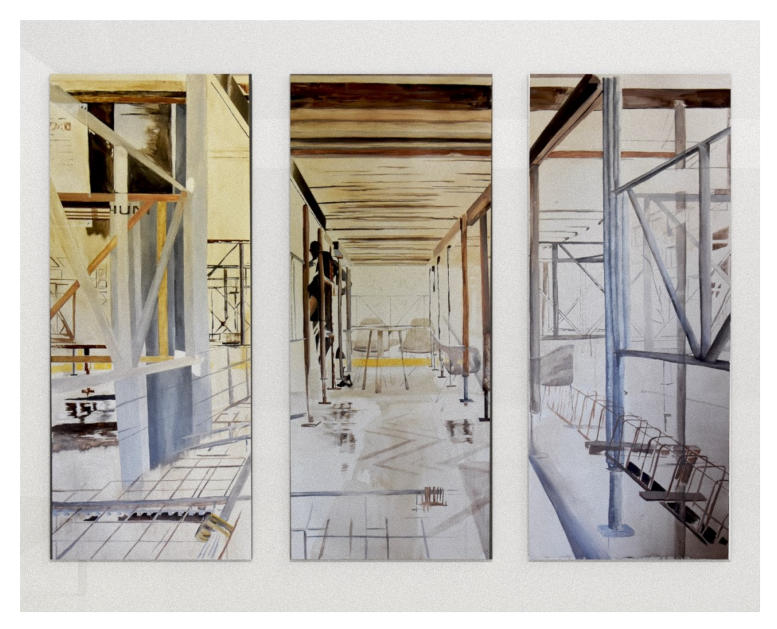
Figure 6: After Site detail view, 225 x 160cm, acrylic; ink; pencil on gesso primed plasticised poster paper, image render.