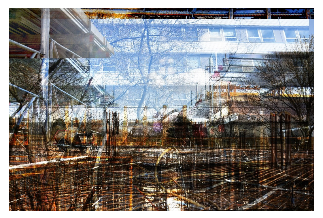
Figure 2: Afterimage II. 6000 x 4000 px, digital collage. Source: Author's own work.

In the 1990s, artists looked to the Situationists of the 1950s, such as Guy Debord, and saw value in what Debord calls the dérive, the act of interacting with the built environment with curiosity and awareness through walking without destination (Marcus, 2002: 4). The term psychogeography, as discussed by Coverley, was coined by Debord himself, who described it broadly as a study of how a place can impact the emotions and behaviours of those who experience it (Coverley, 2010: 8). Artists such as Francis Alÿs, who conducted and recorded various walks in Mexico City, took great inspiration from this approach (Craig, 2016). In creating Afterimages, I took inspiration from the manner and attitude with which these artists viewed the world, not with the action of walking, but with my photographic methods. It seemed that the process of photographing the space in an imaginative way, and not for a particular shot or angle of the building, liberated me from becoming overly focused on form as opposed to honest documentation. I was then better able to capture the details and idiosyncrasies of the site.