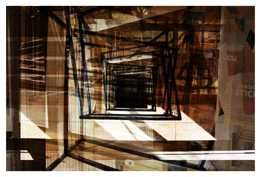
Figure 5: Afterimage V. 6000 x 4000 px, digital collage. Source: Author's own work.

As previously mentioned, the final piece of work resulting from this project, After Site, was a large-scale painting created far away from the Warwick campus, during lockdown at my home in rural Norfolk. This situation was difficult, for instance being unable to return to the Faculty of the Arts building site to re-photograph it to capture its development, as had been my intention. However, I was able to utilise the images I had taken on campus using large scale projection and manipulation to create a more complex merging of the different photographs. My approach to composing the painting was quite different from my digital work, in which I focused on creating a high density of imagery. Within my painting there is a greater emphasis on absence within space, which is perhaps apt given the comparative isolation of lockdown in which the work was created.