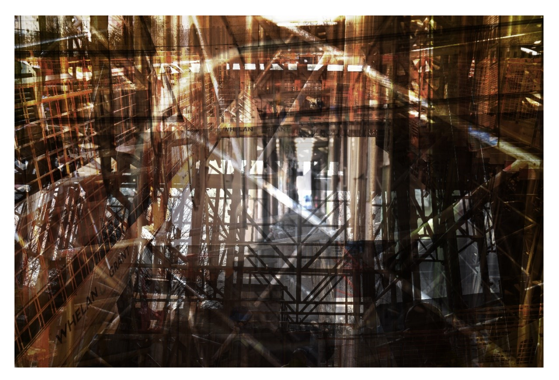
Figure 3: Afterimage III. 6000 x 4000 px, digital collage.