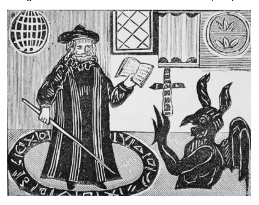
Figure 2. Augustine and Manichaeism II<sup>iv</sup>

Norbert Wiener alluded to the Manichaean devil (Figure 2) as opponent encoded within cybernetics when he revealed, 'like any other opponent, who is determined on victory and will use any trick of craftiness or dissimulation to obtain this victory...The Manichaean devil is playing a